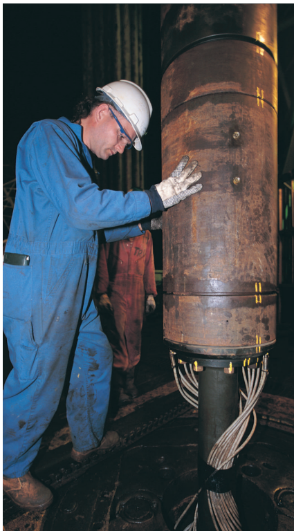
The SentREE test tree is ready to run in West Africa.

years ago. Now, with 13 of these operations having been successful, first-time fears over reliability are being overcome.