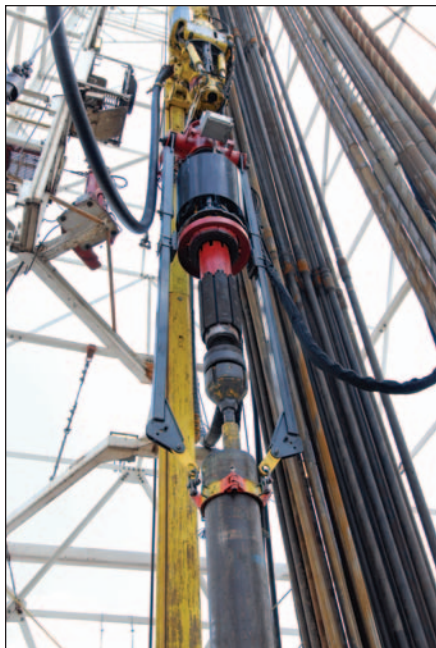
SPE/IADC 105822: Casing installation technology using a new-generation top drive casing running system permits changes in conventional well construction methods.