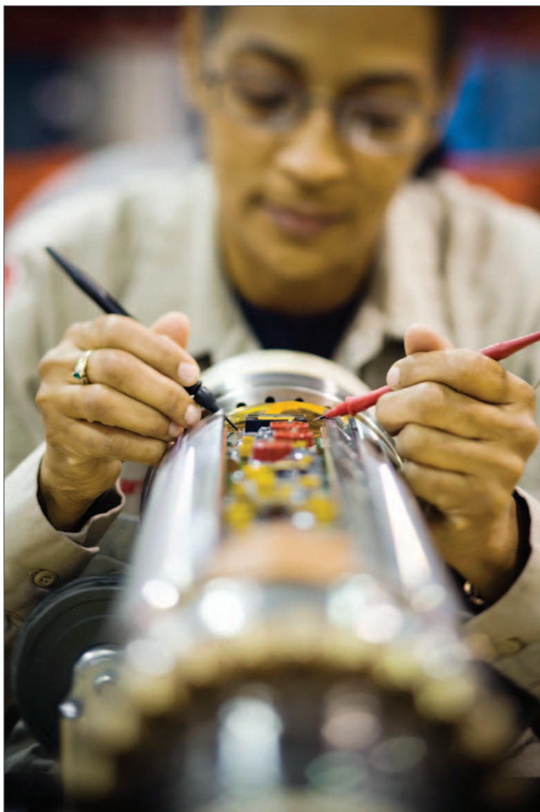
A Weatherford technician calibrates a high-pressure sensor on its LWD system, which is rated to an operating pressure of 30,000 psi.

TO DEVELOP AND produce hydrocarbons from increasingly higher pressure and higher temperature reservoirs, the oil and gas industry needs new drilling, evaluation, completion and production equipment designed to withstand these harsher environments. Operators and service providers alike face these challenges and must collectively take the lead in the research and development of new high-pressure, high-temperature (HPHT) technology to develop and produce deepwater and deep gas discoveries. Three oil majors have identified key challenges in HPHT development and production, and several oilfield service providers have offered insights regarding current or planned technologies to meet these challenges now and in the future.