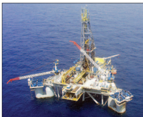
The Noble Amos Runner is scheduled to be equipped with Noble's NC-5SM mooring system, with 12 mooring points for more stationkeeping ability.

NOBLE CORP recently announced that its semisubmersible Noble Amos Runner has established a world record for the deepest "conventionally moored rig" by mooring in 7,650 ft of water in Green Canyon Block 955. The rig will be drilling at this location, about 200 miles south of Houma off the Louisiana coast, for Kerr-McGee Oil & Gas Corp , a subsidiary of Anadarko Petroleum .